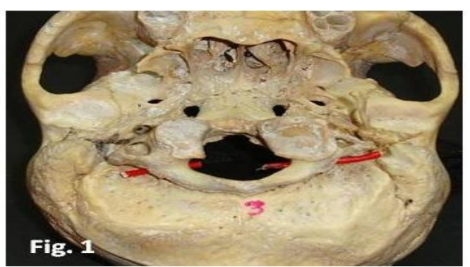
Figure 1. Photograph showing bilateral canal between atlas and occipital for passage ofvertebral artery (red wire).

The cranial half of first cervical sclerotome combine with the caudal half of last occipital sclerotome to form the base of skull. While the caudal half of first cervical sclerotome combine with the cranial half of second cervical sclerotome to form the first cervical vertebra. The pattern continues in this way to form rest of the vertebra. The dens of second cervical vertebra is formed by the body of first cervical vertebra, thus the first cervical vertebra doesn't have body(Sadler 2007).