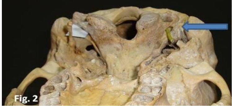
Figure 2.Photograph showing a foramen (yellow wire) formed between costotransverse bar(blue arrow) and jugular process on right side for exit of first cervical nerve.